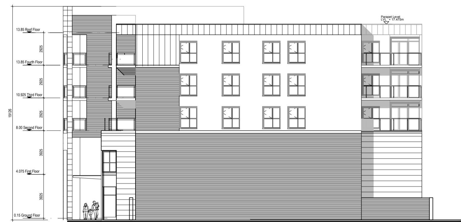
ELEVATION 3 - 3