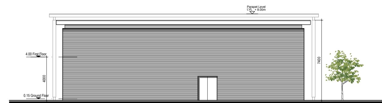
ELEVATION 2 - 2