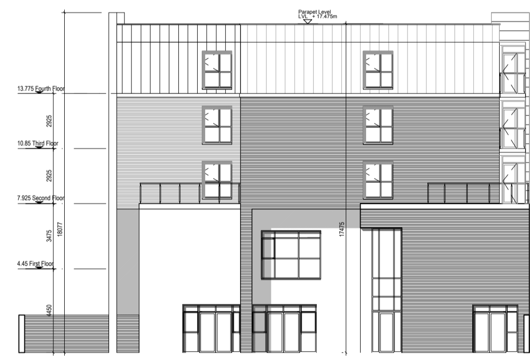
ELEVATION 4 - 4